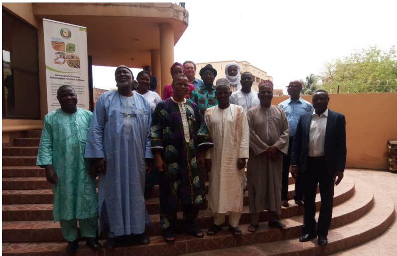
Photo 3 : Family photo after the opening ceremony of the meeting with POs in Bamako