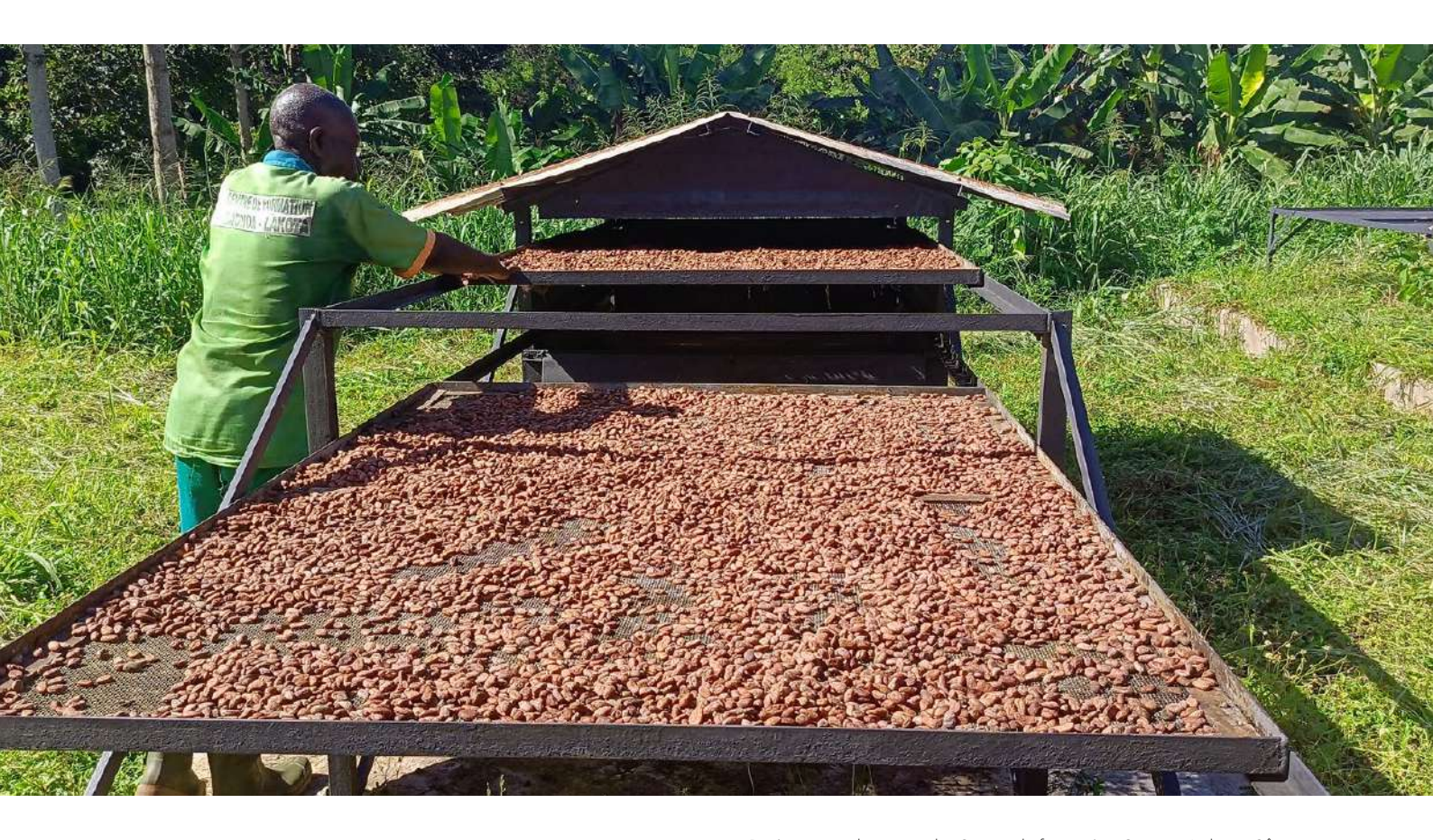
Drying cocoa beans at the Centre de formation Gagnoa-Lakota, Côte d'Ivoire