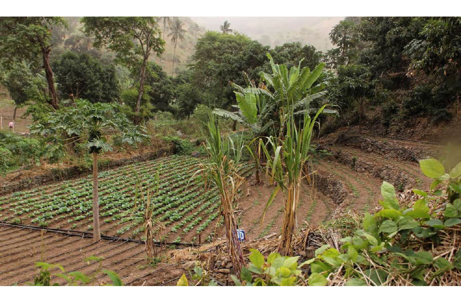
Agroecological market gardening with drip irrigation in Cape Verde, © Issala-PAE/ECOWAS, 2023