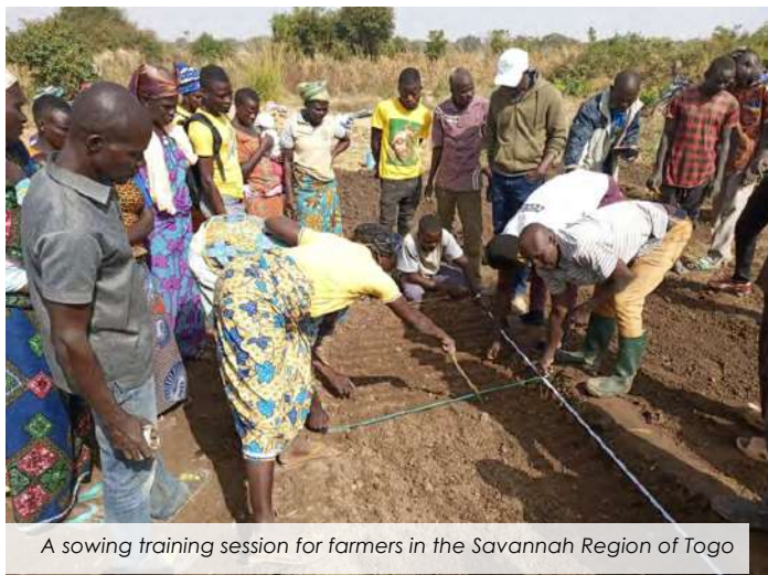
A sowing training session for farmers in the Savannah Region of Togo

For the phase 1 of FSRP countries (Burkina Faso, Mali, Niger and Togo), 2023 was the second year of the programme's implementation. Major achievements have been recorded in these countries. Here are some of the key achievements in Niger and Togo.