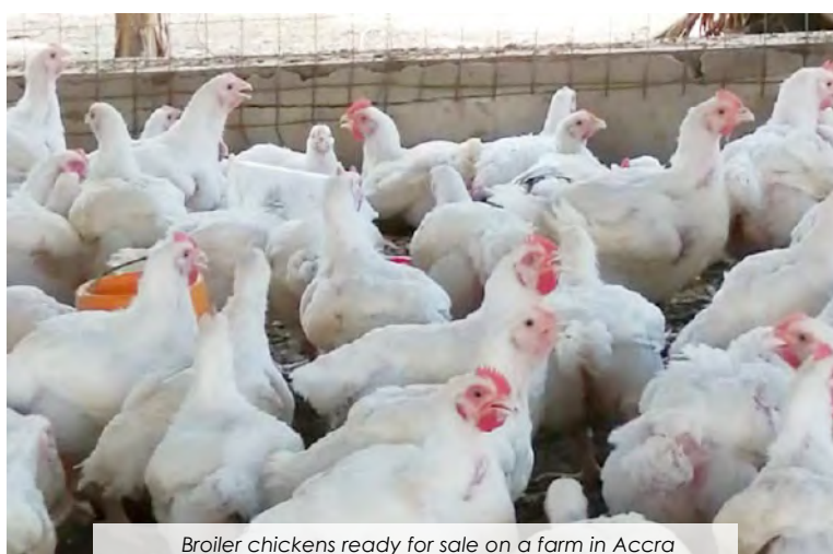
Broiler chickens ready for sale on a farm in Accra

Ghana: FSRP brainstorms with Lead Ghanaian Poultry Industrialists for Take-Off