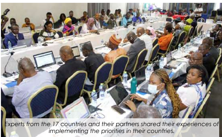
Experts from the 17 countries and their partners shared their experiences of implementing the priorities in their countries.

More than eighty-five food safety experts from seventeen countries in West Africa and the Sahel and their partners met in Accra from February 26 to 28, 2024 to take stock of food safety in the sub-region. Set up as a regional network for regulatory convergence ... Read more