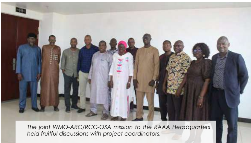
The joint WMO-ARC/RCC-OSA mission to the RAAA Headquarters held fruitful discussions with project coordinators.

Established in July 2020 as the Regional Climate Centre for West Africa and the Sahel (RCC-WSA) by the ECOWAS Commission, the AGRHYMET Regional Centre (ARC) now provides regional climate monitoring based on field observation data ... Read more