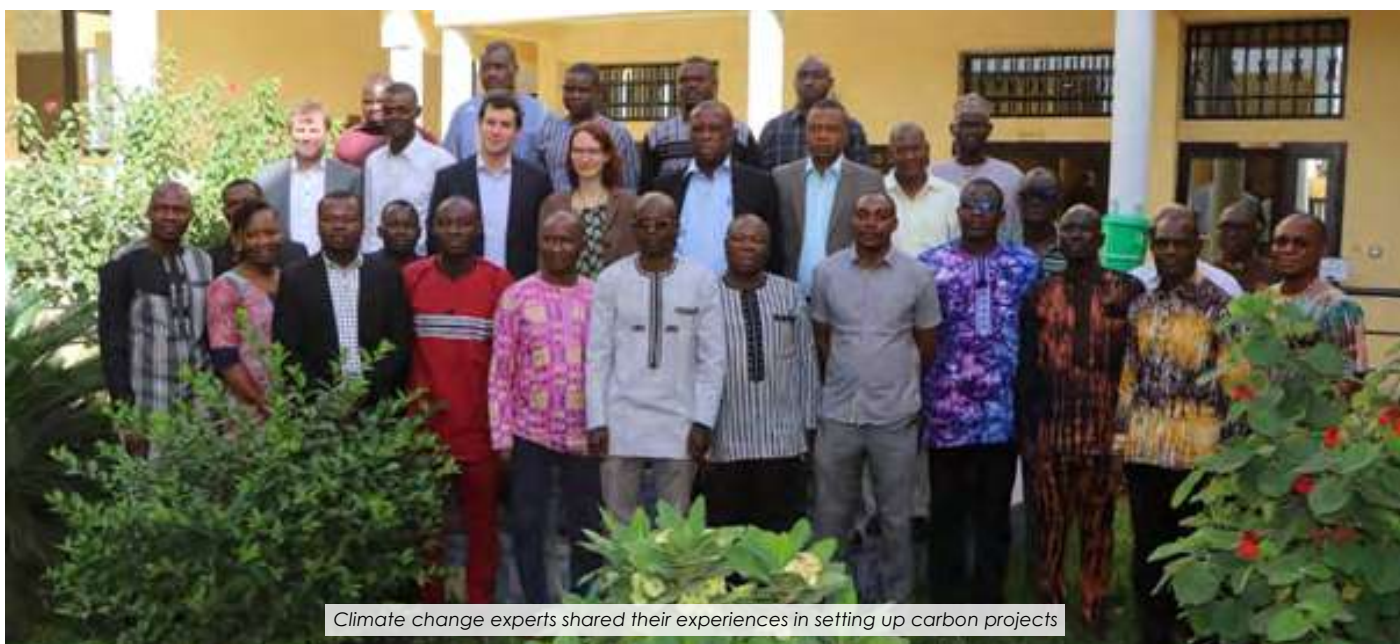
Climate change experts shared their experiences in setting up carbon projects

Burkina Faso/Climate change adaptation: the FSRP intends to focus its activities on carbon projects