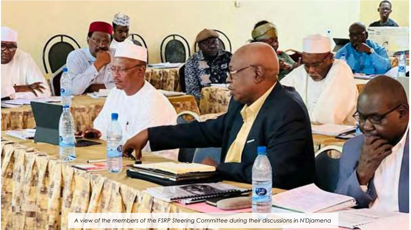
A view of the members of the FSRP Steering Committee during their discussions in N'Djamena

The first session of the National Steering Committee (NSC) of the Food System Resilience Program (FSRP) in Chad was held in N'Djaména/Chad on 22 February 2024. This meeting, organized under the aegis of the Ministry of Agricultural Production and Processing, enabled the members of the NSC to review the state of implementation of the FSRP in Chad... Read more