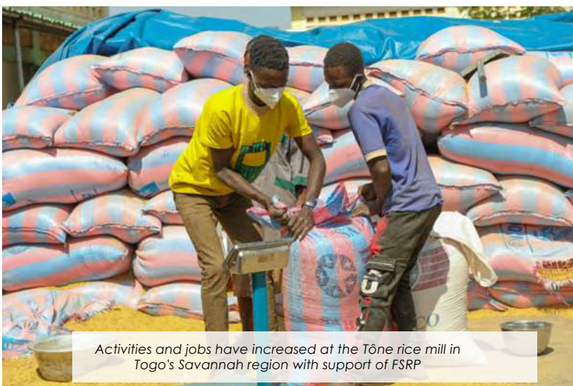
Activities and jobs have increased at the Tône rice mill in Togo's Savannah region with support of FSRP

As part of its activities in the Savannah region of Togo, the West Africa Food System Resilience Program (FSRP) has acquired and distributed inputs to more than 500 producers, each of whom received 10 kilograms of rice seeds and 75 kilograms of fertilisers Urea) free of charge at subsidised cost, with repayment in kind (in paddy rice) at harvest ... Read more