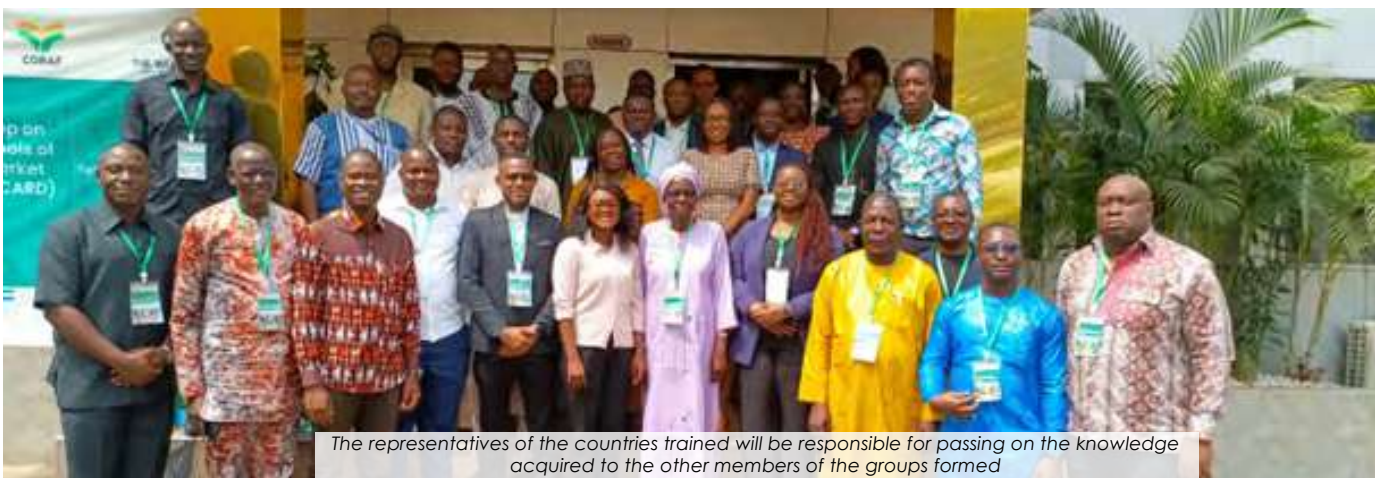
The representatives of the countries trained will be responsible for passing on the knowledge acquired to the other members of the groups formed

23 stakeholders and partners specialized in agricultural trade and markets in West Africa and Chad now have a better understanding of the ECOWAS Agricultural Trade and Market SCORECARD (EATM-SCORECARD). The participants, from Burkina Faso, Ghana, Mali, Niger, Sierra Leone, Chad and Togo, and ... Read more