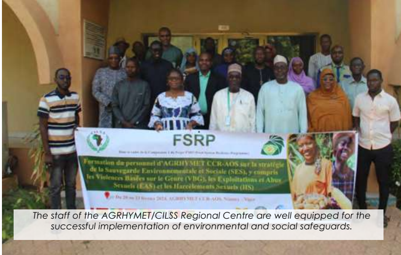
The staff of the AGRHYMET/CILSS Regional Centre are well equipped for the successful implementation of environmental and social safeguards.

From 20 to 23 February 2024, around twenty members of staff from the AGRHYMET Regional Center gained a better understanding of how to consider the concepts of environmental and social safeguards, including gender-based violence (GBV), sexual exploitation and abuse (SEA) and... Read more