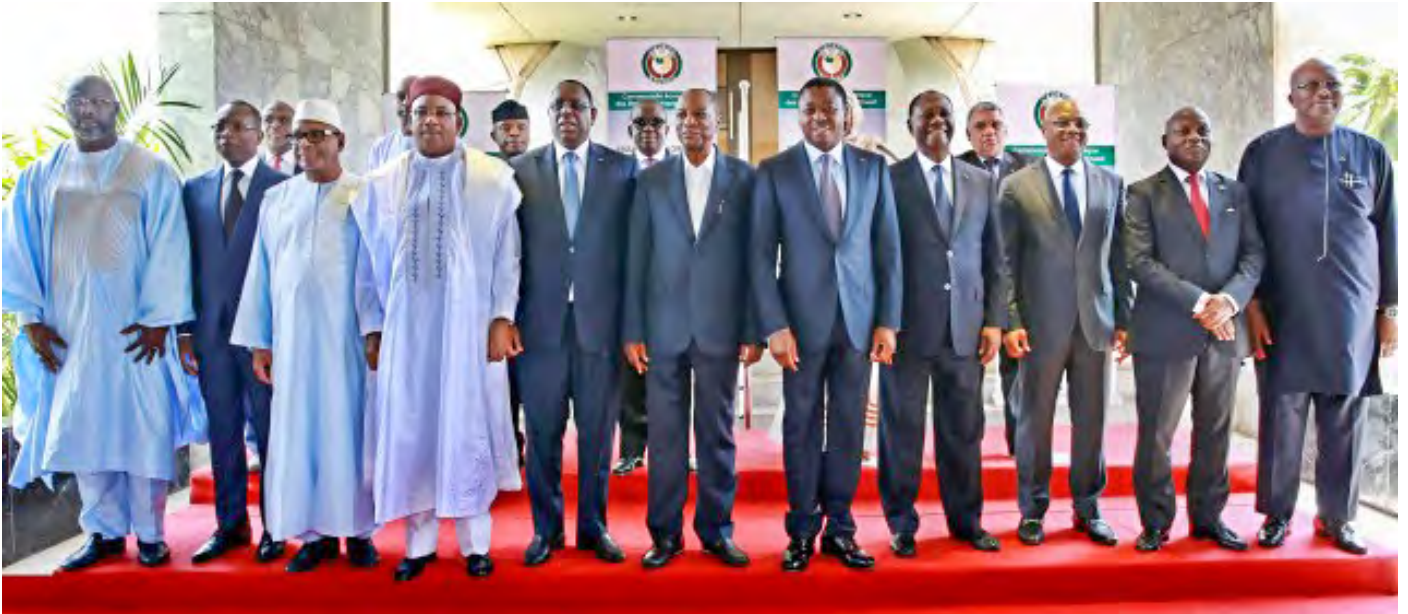
Partial view of the Head of State and Government Summit of July 2018 in Lomé

To date, the Regional Food Security Reserve as a major regional concern, is part of the agricultural, social and political agendas of all ECOWAS member States. The Heads of State are well aware of the need to quickly contribute in the Regional Fund for Agriculture and Food, in order to allow this regional solidarity mechanism to fully play its role by adequately taking care of the development of the agricultural sector and food security on the basis of regional priorities.