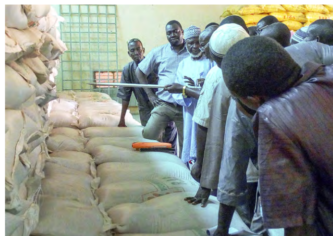
Partial view of the Niamey trainees doing sampling exercises in an OPVN warehouse in Niger

In addition, pending the launch of new calls for tenders by ECOWAS and in order to meet the information and training needs of POs on tender documents, the consortium is currently focusing its efforts on the strengthening of POs capacities. To this end, a first series of trainings is scheduled in several French and English-speaking countries of the region on various themes identified from the self-evaluation of POs. A training was conducted in Kaduna, Nigeria, last August, which helped build the capacity of two Nigerian federations of producers' organizations (Jussaf and Rice and Wheat Farmers' Association) on the conduct of cereals quality analysis. The same support was given to three federations of POs (Mooriben, SAA and Fucap) in Niger and a training on accounting, administrative and financial management provided to two Burkinabe POs (UPPRS and Fepab) in September. Discussions are in progress to define the type of support to be provided to Mali (AOPP), to Guinea (Cnop) and Senegal (Asprodeb).