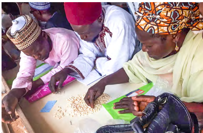
Partial view of the Kaduna trainees exercising in quality control (impurity) on a maize sample

In its effort to structure the demand for cereals and increase the incomes of local producers, ECOWAS clearly indicates that the supply of products for the Regional Reserve must be made primarily through the associations of producers and processors of the region. In addition, by gradually positioning themselves through sustained advocacy and lobbying efforts, POs are more and more at the forefront of the battle for greater access to institutional markets and thus, remind ECOWAS that it must further promote a friendly-environment for investment to drive improvements in local production and processing practices.