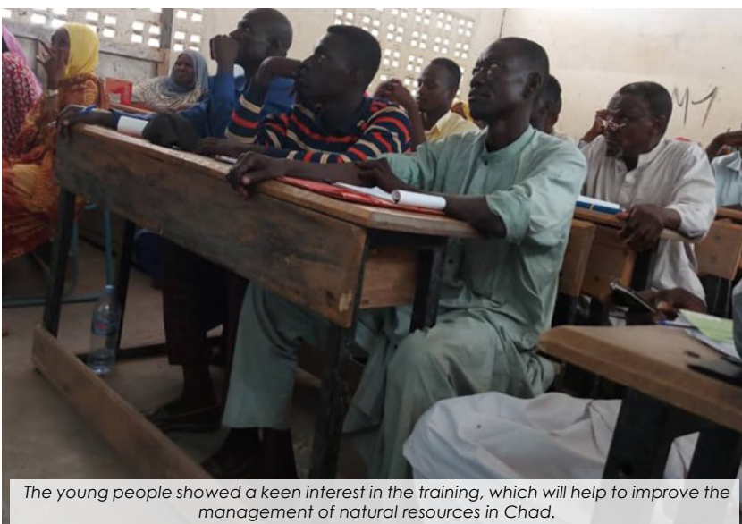
The young people showed a keen interest in the training, which will help to improve the management of natural resources in Chad.