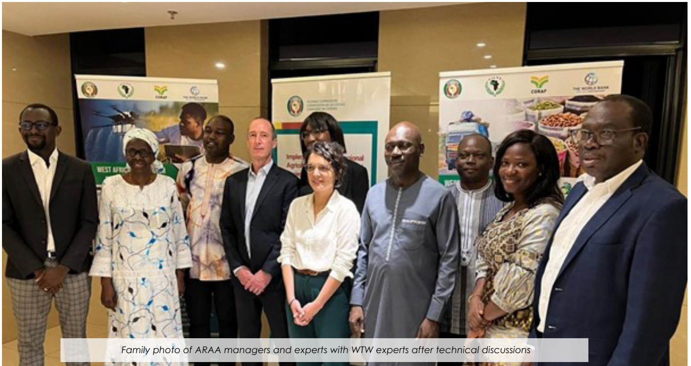
Family photo of ARAA managers and experts with WTW experts after technical discussions

As part of the World Bank's support to strengthen the ECOWAS Regional Food Security Reserve (RRSA) through the GRiF activities of Component 3 of the FSRP, a visit by WILLIS TOWAERS WATSON to experts from the RAAF/ECOWAS, particularly... Read more