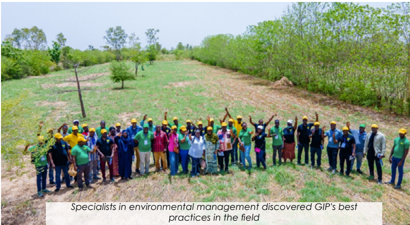
Specialists in environmental management discovered GIP's best practices in the field

With a view to strengthening the resilience of farmers in the face of climate hazards and land degradation, CORAF has just mapped out good Integrated Landscape Management (ILM) practices in West and Central Africa... Read more