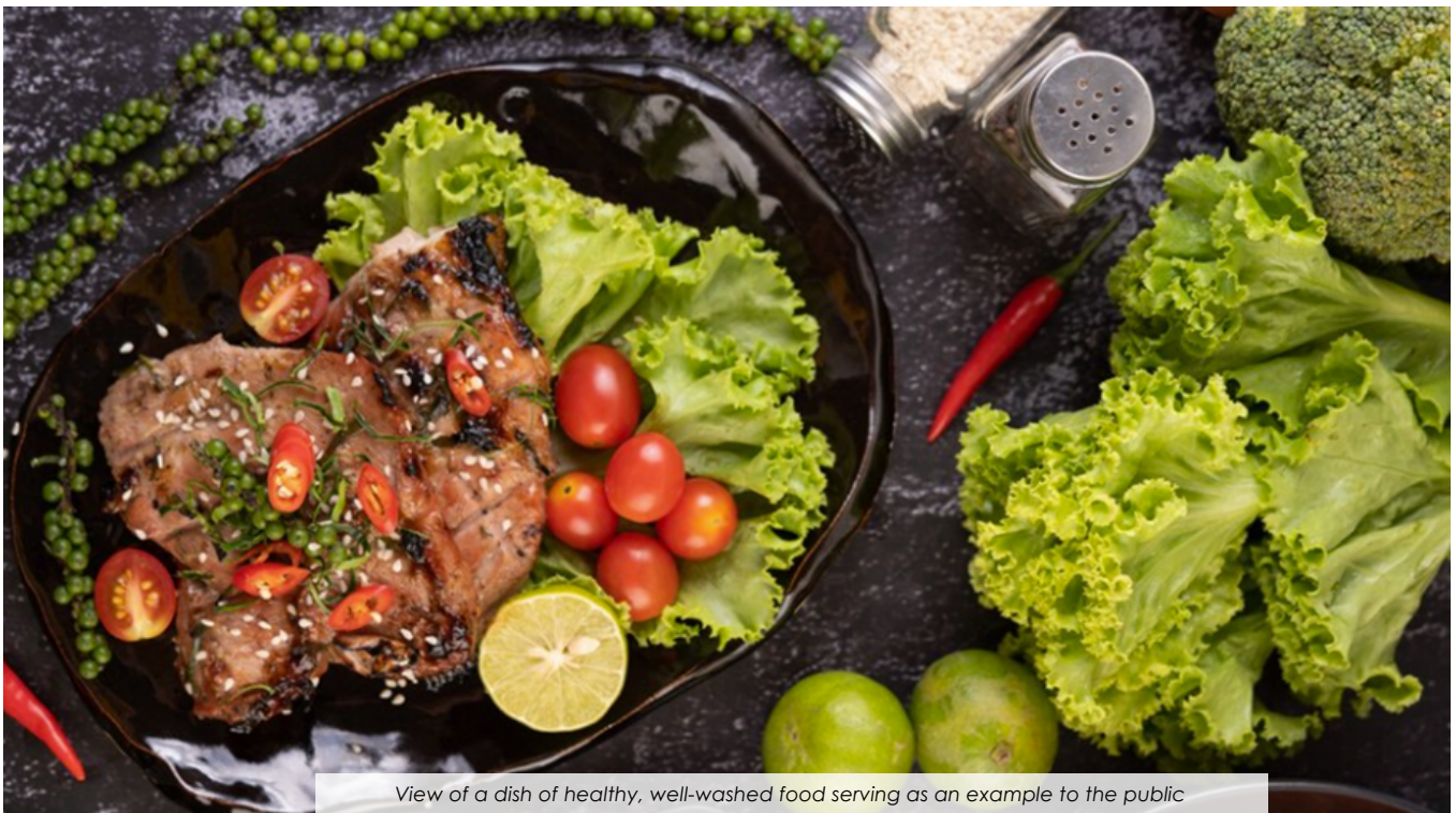
View of a dish of healthy, well-washed food serving as an example to the public

On 7 June 2024, the international community celebrated the 6ème International Food Safety Day on the theme "Food safety: preparing for the unexpected", inviting everyone to try to adopt healthy eating practices... Read more