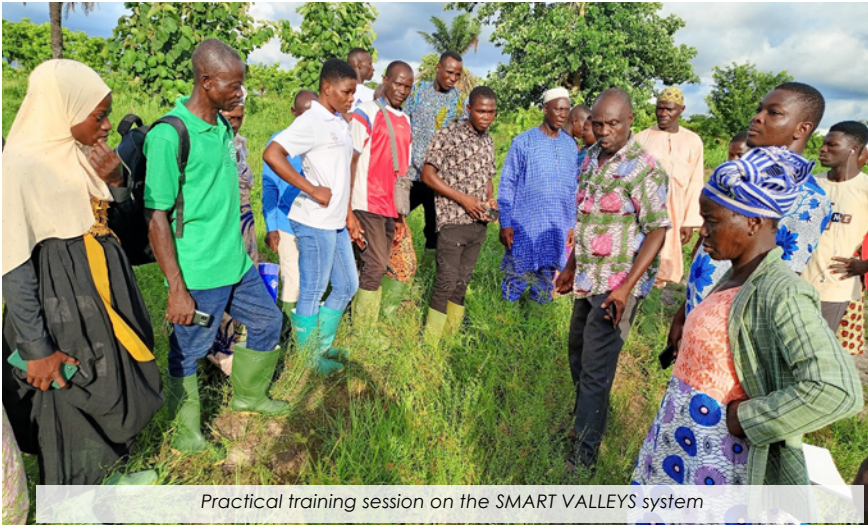
Practical training session on the SMART VALLEYS system

Togo: the SMART VALLEYS approach taught to 20 pilot rice growers with a view to its adoption and extension to 120 other rice growers