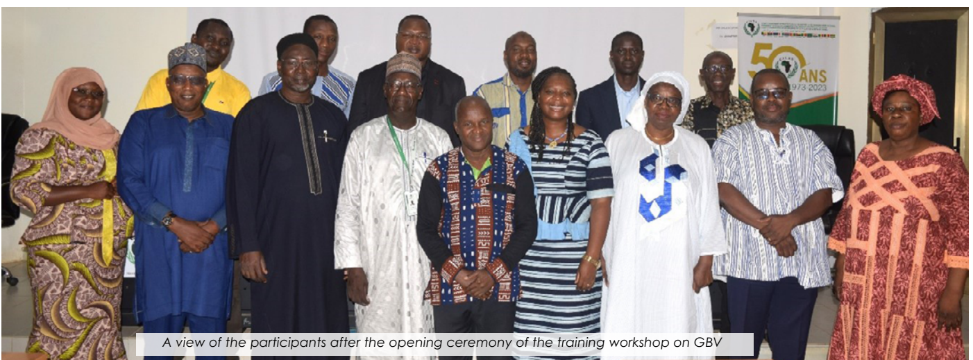
A view of the participants after the opening ceremony of the training workshop on GBV

As part of the implementation of Component 1 of the West Africa Food System Resilience Programme (FSRP), a capacity-building workshop was held from 24 to 26 June 2024 in Niamey/ Niger for the staff of AGRHYMET CCR-AOS, a specialised agency of the Permanent Inter-State Committee for Drought Control in the Sahel (CILSS) based in Niamey... Read more