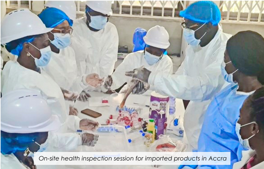
On-site health inspection session for imported products in Accra

ECOWAS trained around one hundred Ghanaian and Burkina Faso practitioners and regulators involved in food and agricultural trade on sanitary and phytosanitary (SPS) measures to ensure food security in the sub-region, from 10 to 14 June 2024 ... Read more