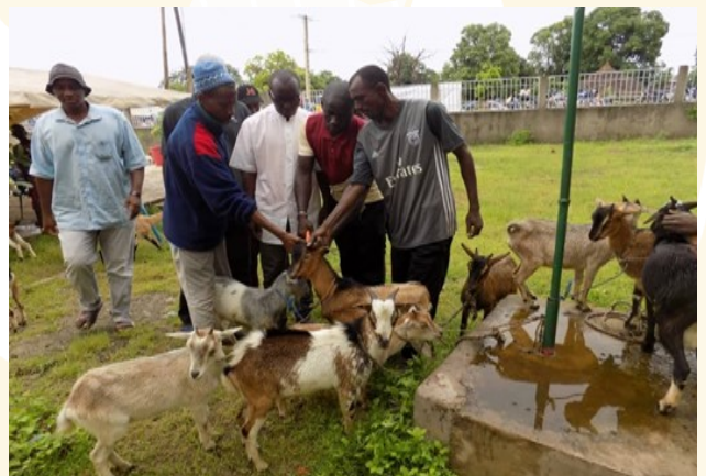
Distribution of animal kits