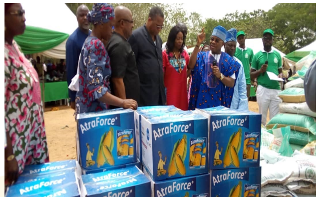
Distribution of agro-inputs