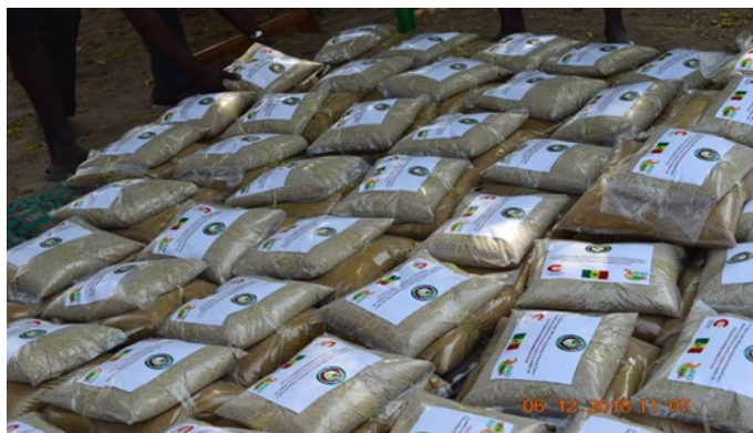
Distribution of food kits