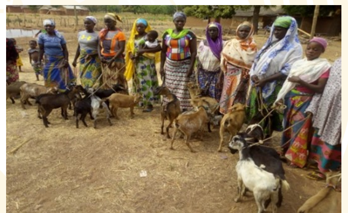
Infant nutrition and animal breeding