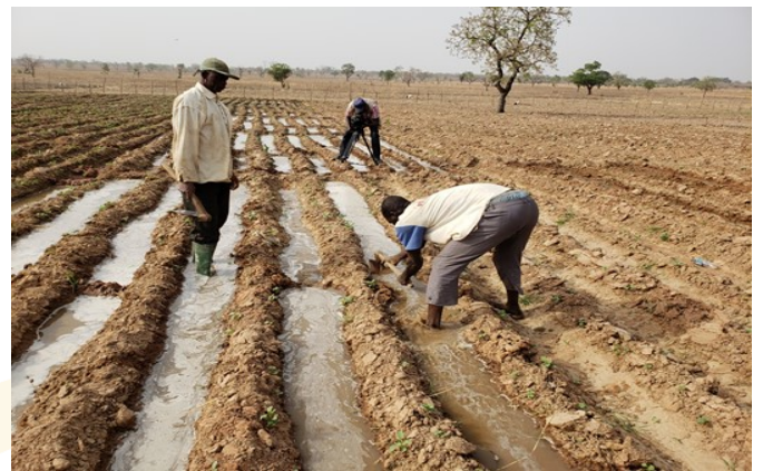
Mobilisation and water management during dry season