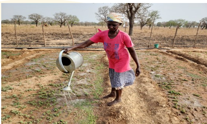
Counter Season gardening